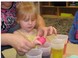
(Angelina's pink egg)