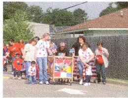
The Owl's float

The Tiggers (right) and Hunny Pots (below) were the KID FIRST Riding Club