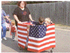
The Piglets had a flag float

KIDS FIRST held a parade celebrating Independence Day on Friday, July 2. Like any good 4th of July parade, there were floats, riding clubs, and a whole lot of Uncle Sams and Lady Liberties. With patriotic music piped through the intercom system, the classes went out the back door, around the building and back through the front door to the delight of the many parents who came to watch. The rooms all did very patriotic and imaginative decorations to show their spirit.