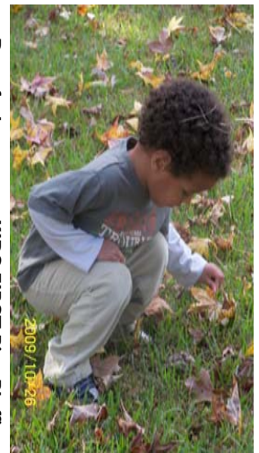
Day of adventure at KIDS-FIRST Pine Bluff!