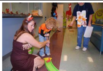
Thank you parents who joined us For our Trick or Treating and Costume Parade!

Construction is scheduled to be completed by November 11th, 2010! We are almost done. Thank you all for your patience and understanding during our remodel. After the first of the year we will be having a formal grand reopening celebration.