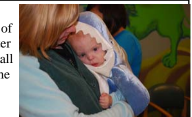
Thank you to staff who helped make Trick or Treating Bags!