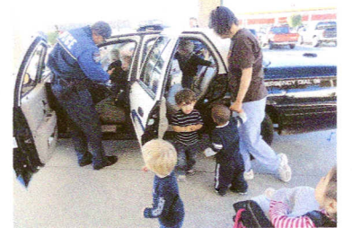
(The roos crawled in and out of the squad car)