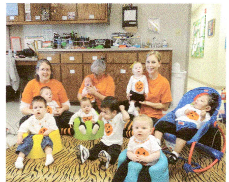
(The baby room made matching shirts for Halloween)