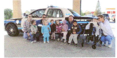
(The Piglets pose with the police)

As the weather gets cooler, please remember to send a jacket for your child when they are on the playground. Now is also the time to check your child's cubby and make sure they have a change of clothes that is appropriate for fall temperatures