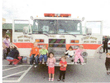
(Above: Eeyore's explore the fire truck)

dren had a great time and learn a lot as well.