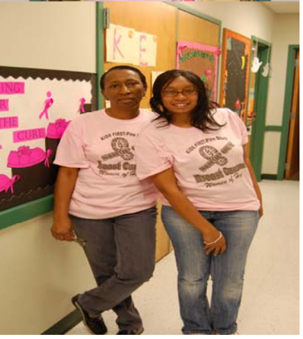
SPECIAL THANKS TO OUR STAFF TEACHER/PHOTOGRAPHER BARBARA PORTER FOR THE WONDERFUL PICTURES