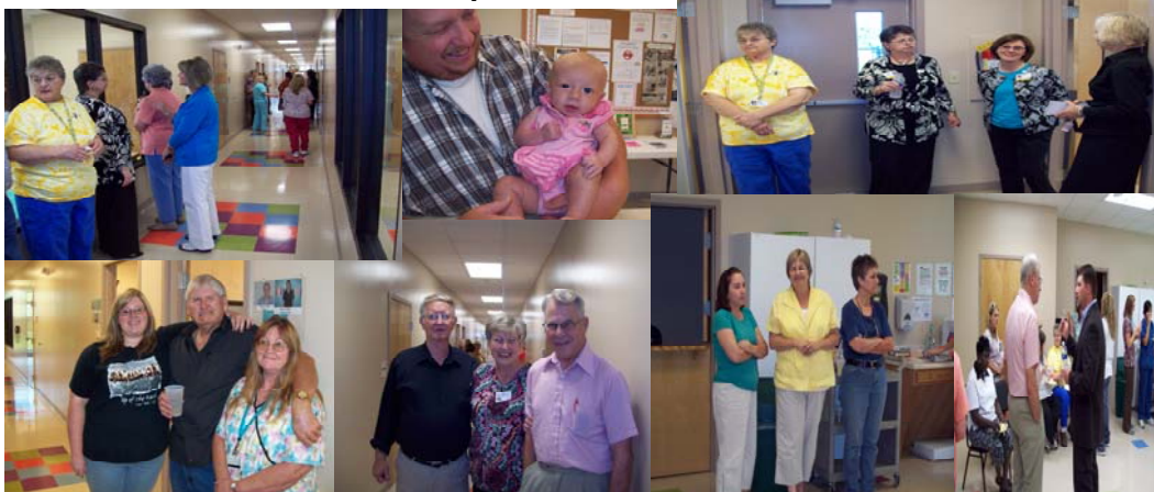
Scenes from KIDS FIRST open house.